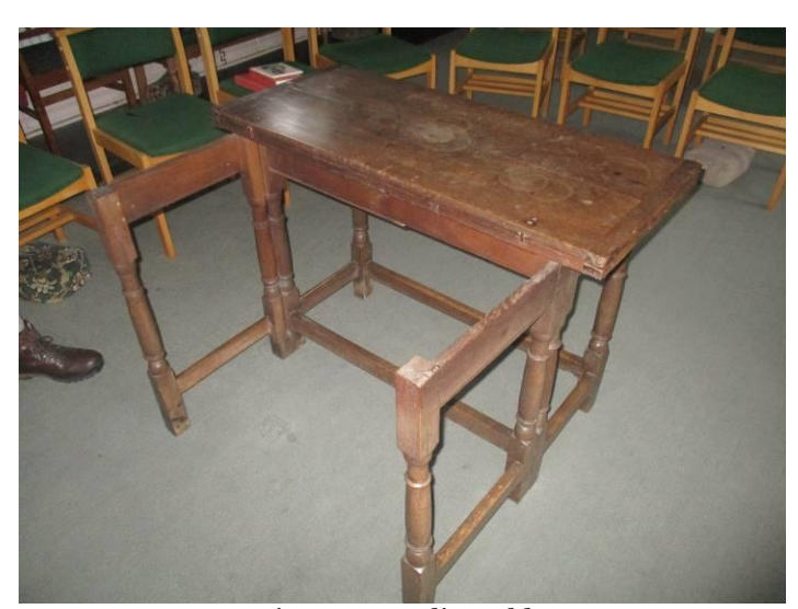
Figure 3: Replica table

In Adderbury, an oak table used by George Fox at the opening ceremony in 1675 was donated by Bray Doyley. The table was kept at Adderbury until the Second World War when it was relocated to a local Quaker's house for safe keeping; it is now at Swarthmoor Hall. According to Wood (1991), in the late eighteenth century South Newington's meeting house was built, modelled on Adderbury and a replica table was made which stayed with the meeting until its closure in 1910, subsequently relocated to Banbury. The replica table is in the smaller meeting room, now used for worship (Fig.3).