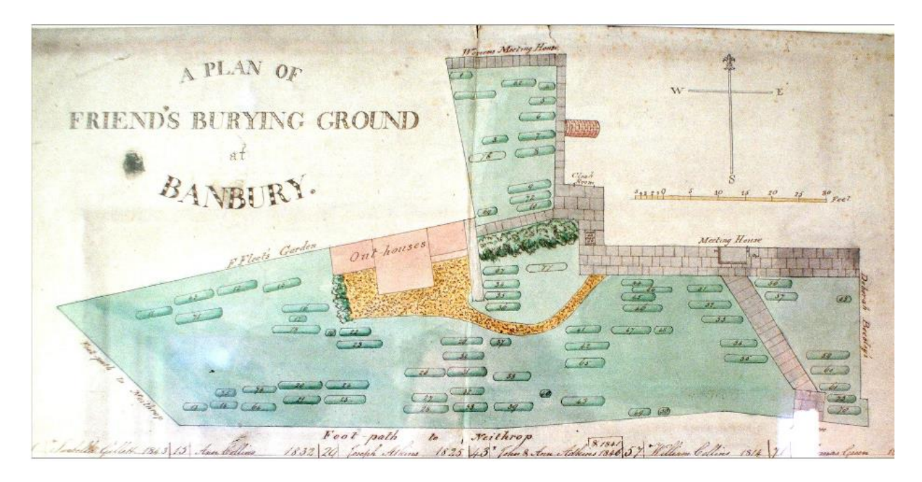
Figure 6: Undated plan of the burial ground

Locally significant burials include Benjamin Kidd (1693 - 1751); for thirty-eight years he was a Minister in the Society of Friends, and travelled to America extensively. He died on the 21 May 1751 and was buried at Banbury three days later.